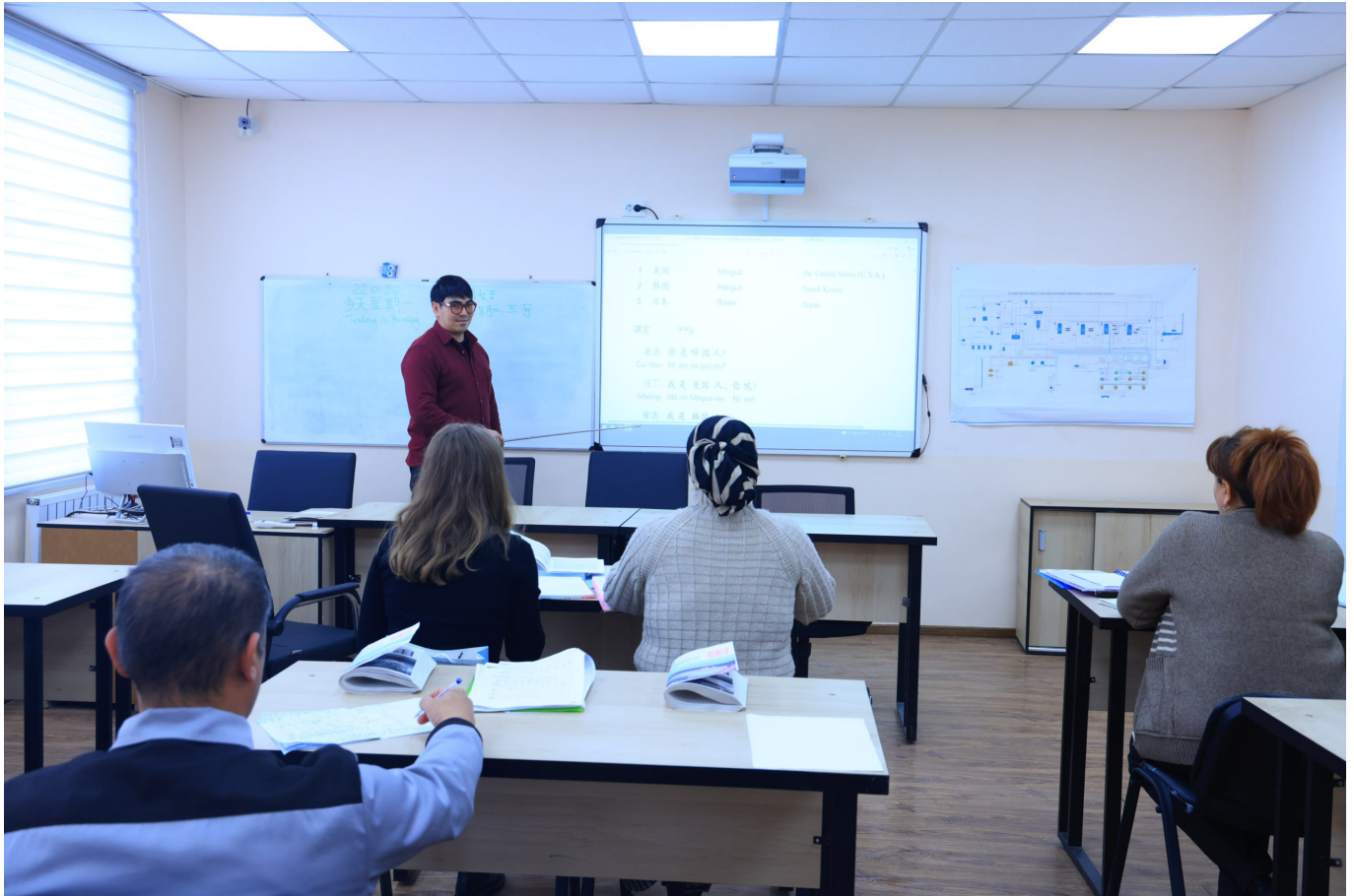
English language classes are held on Mondays and Wednesdays from 1:00 p.m. to 5:00 p.m., while Chinese language classes take place on Tuesdays and Thursdays from 1:00 p.m. to 5:00 p.m.